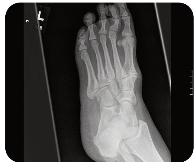
Post-op (12 weeks)