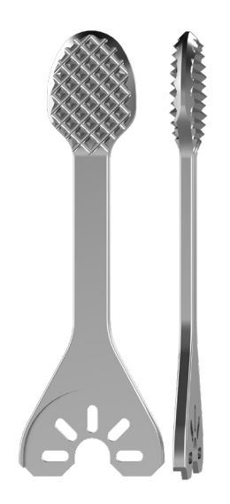
Flat Single/Double Sided