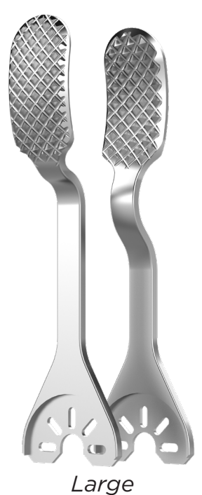
Curved (3D) Concave/Convex